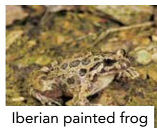
Iberian painted frog