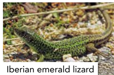
Iberian emerald lizard

Andalusia has lots of different wild animals. These include the following: